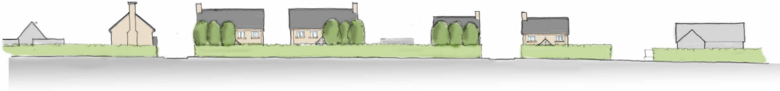
Indicative Street View From Cranford Road Showing existing boundary hedge and new boundary trees